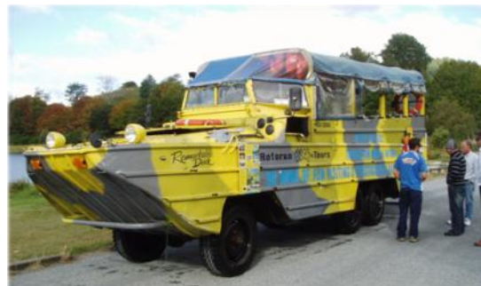
The amphibious vehicle used for the Rotorua land and water tour.

steelwork, which is often of poor quality is not properly assessed at the tender stage of a project. The cost of repair and