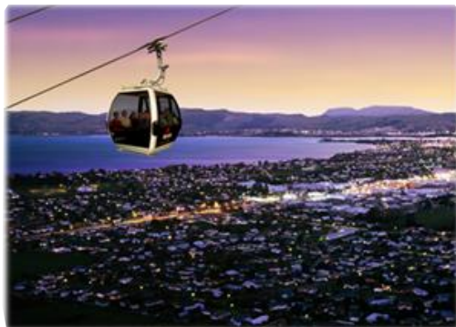
The dusk view from the gondola going up Mt Ngongataha.