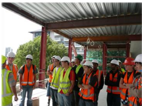
Students shown structural steel construction.

The students and their lecturer were impressed with what they saw, the comment was made how few staff there were on the shop floor for the size of the operation. This is made