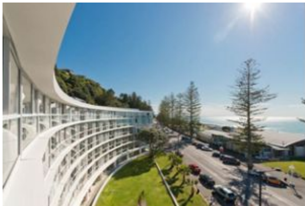
Scenic Hotel Te Pania, Napier

The social side will stretch into the weekend as delegates have the opportunity to take part in a winery tour on Saturday morning.