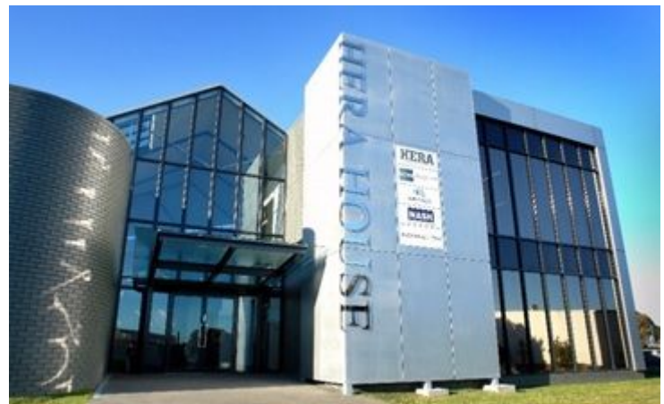
HERA House, home of SCNZ

The story traces the organisation's roots back to the 1970s, with the black shell of the unfinished 30-storey BNZ building in Wellington forming a visible demonstration of the disastrous industrial relations of the time. The 1980s saw the dawn of HERA and the development of positive messages about the role of steel structures in New Zealand multi-storey construction. By the 1990s, there had been a distinct change in attitudes towards steel framed structures as a result of HERA's work, with designers increasingly turning to structural steel.