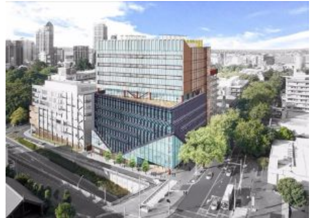
University of Auckland, Science Tower

The Science Tower is one of the first buildings in New Zealand to be designed using BRBs, and the first to procure them from the USA. Structural engineering firm Beca undertook a significant pre-qualification process to provide assurance that what it was specifying could be built. As part of this exercise, Beca drew on the collective knowledge of six New Zealand fabricators relating to techniques such as welding, bolting and erection.