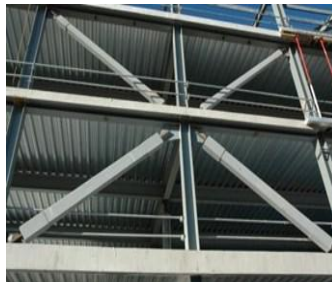
Buckling Restrained Braced Frame (BRBF)