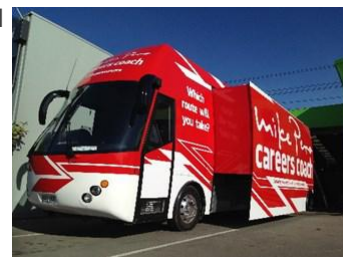
The Careers Coach

1 st November). SCNZ is on board as a key sponsor. There's been great interest from whole communities, not just schools, and several mayors have dug into their funds to help get it to their region.