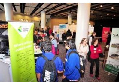
Delegates taking in the sights and sounds of the SteelCon Careers Update 2015

" Steel yourself for a bright future " is SCNZ's new short film introducing the industry and its various roles. Its first outing was at SteelCon Careers Update 2015 and it'll